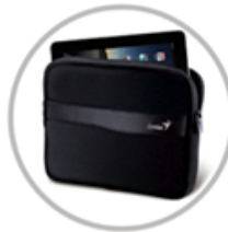
Perfect for iPad