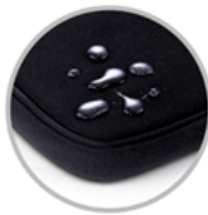
Protects against liquids