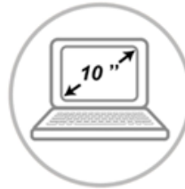
Fits up to 10" netbooks