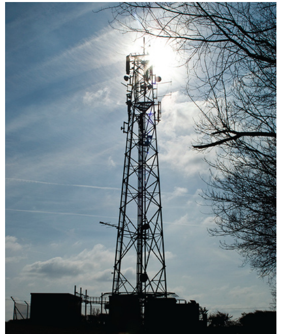
Cellphone base station is the most vital part of communications network

This is one of the many innovative ways that Tramigo T22 devices can be used. There are already hundreds of different applications where client are trusting Tramigo products, ways of usage range from personal safety to